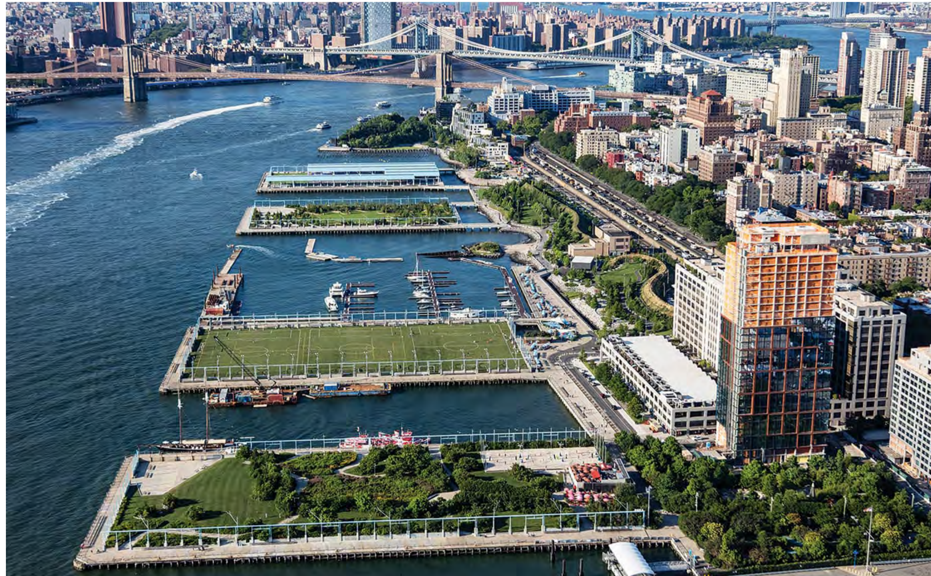
Brooklyn Bridge Park, NYC - wide-ranging community leisure and recreation provision across an extensive waterfront site, now a major local destination