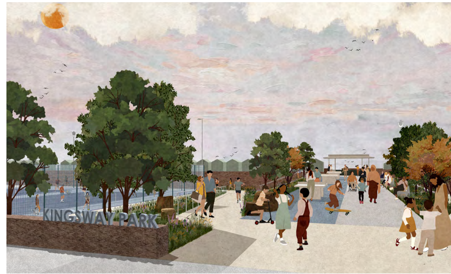
View south of Park entrance from Kingsway towards the Esplanade