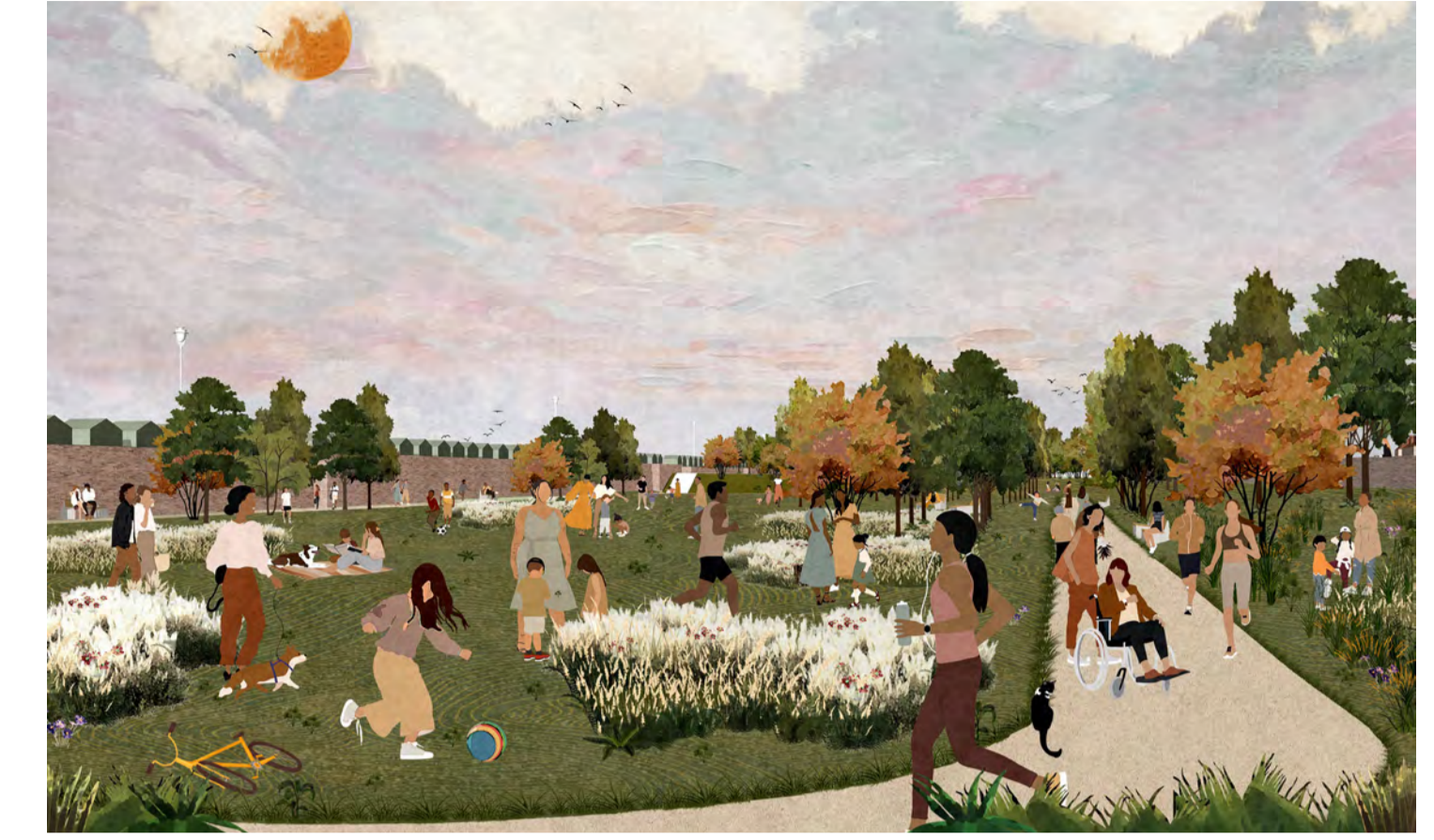
View looking south west across new Park Garden