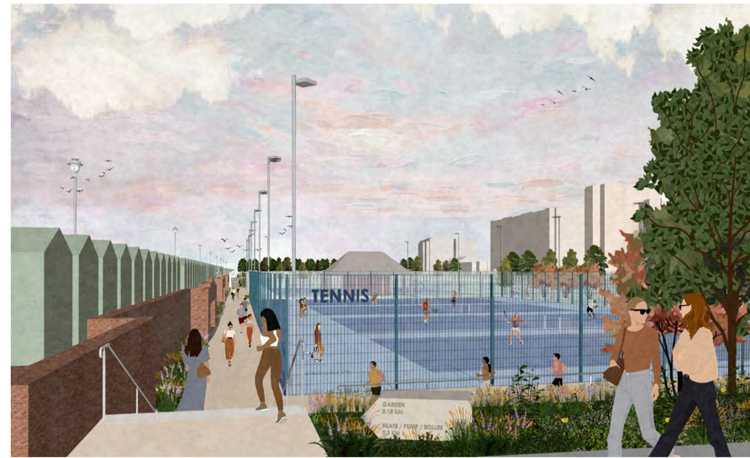
View west along accessible route beside Tennis Courts