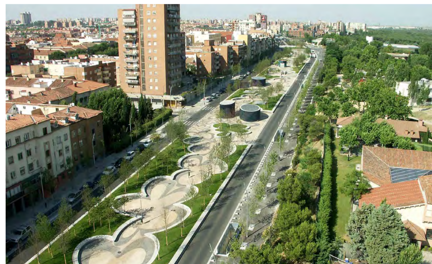
Madrid Rio - a linear park with outdoor 'rooms' framed by new soft landscape