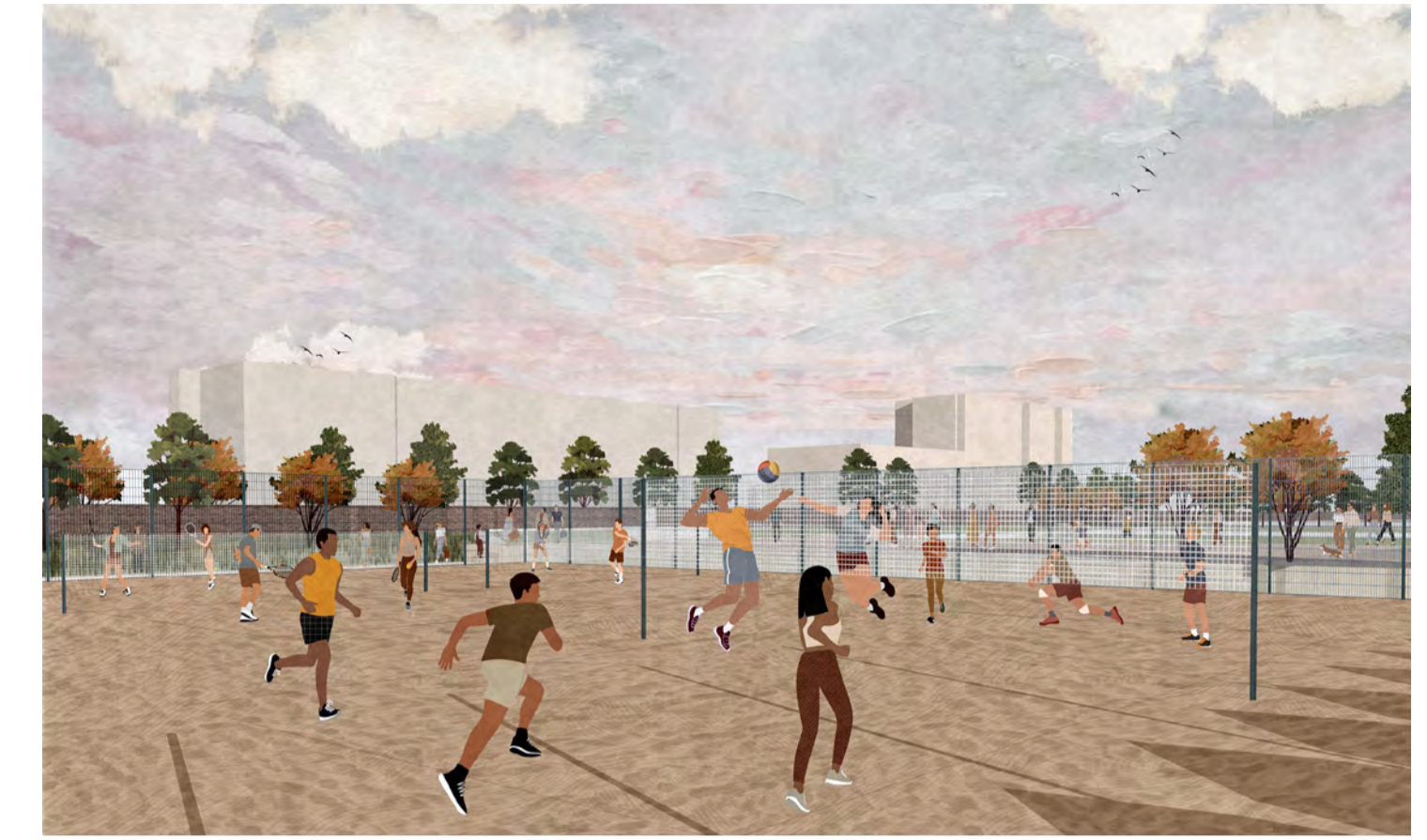
View looking north-east in new Beach Sports area, showing Volleyball and Tennis