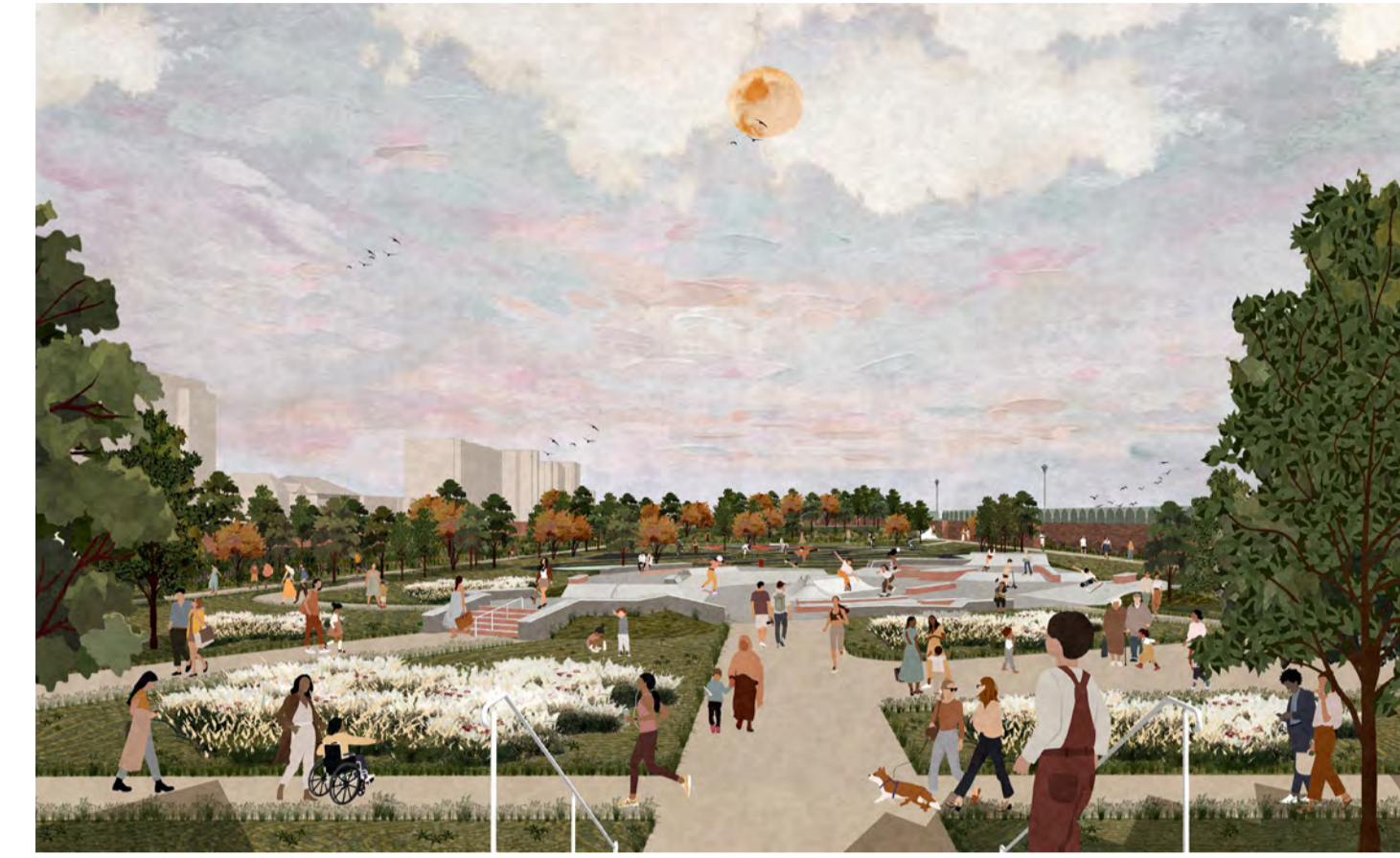
View east from new entry into Skate Park / Pump Track / Roller Plaza area

- Key existing park uses like Tennis, Bowls and Croquet are all retained, and complemented by new uses including Padel Tennis, Beach Sports, and 'Wheeled' Sports