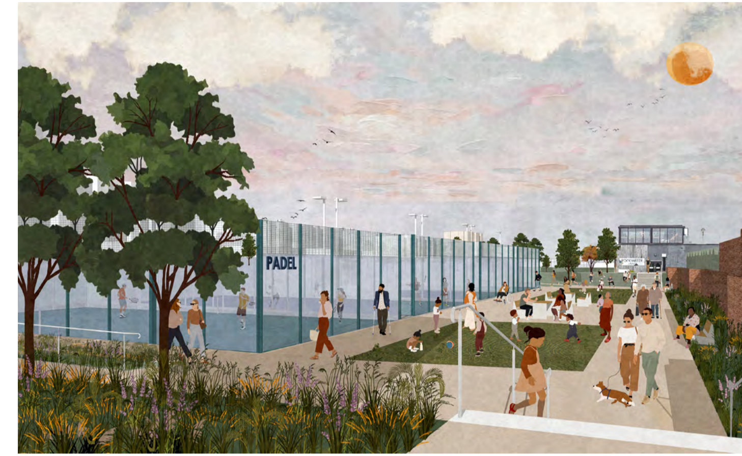
View looking east of new Padel Tennis Courts, with Rockwater in background