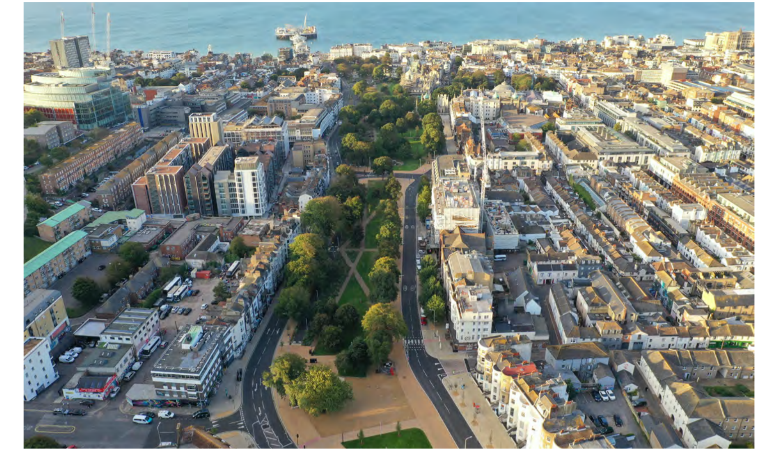
Valley Gardens, Brighton - integrated city centre routes and leisure spaces for all

Kingsway To The Sea is a once-in-a-generation opportunity to deliver a fantastic improved park for Hove. Below are some other ambitious examples of new linear parks from around the world.